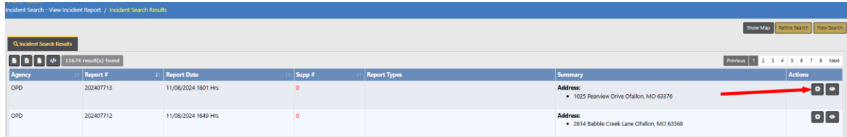
FIGURE 2: ADD INCIDENT NOTE